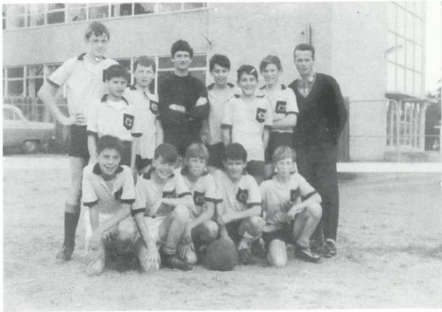
FRANKSTON UNDER 14 RUNNERS UP 1967 SOUTH OF THE YARRA