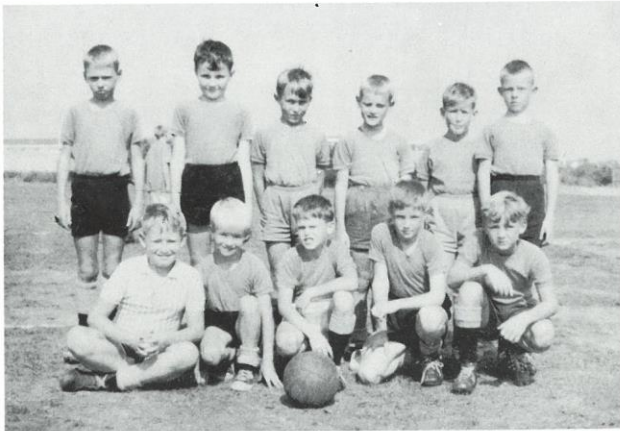
FRANKSTON UNDER 10 YEARS