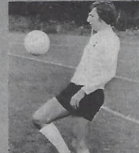
Former England international and Frankston City guest player Martin Peters above off his skill by juggling the ball on his face.

The club was summoned to appear before a court for outstanding rent of about $3000. A consent ultimatum meant that Frankston had to pay $800 a month. It has ever that payment regularly.