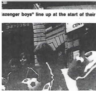
"Slazenger boys" line up at the start of their