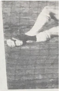
Essendon City from the pen

Dandenong, with an unconvincing win over Prahran, are only a fraction of goal average away from top spot.