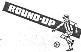
FIRST ROUND OF THE PROVISIONAL LEAGUE CUP ( FIRST XI ) 7/10/90 3.00pm